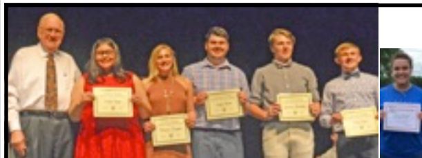
Scholarship Recipients 2019

is a nonprofit organization dedicated to inspiring the arts. We encourage and promote appreciation for the fine arts through education and community events. Our goal of the annual events – Mardi Gras Murder Mystery, Gatsby Days and more – is to raise funds to provide scholarships for area students pursuing an education in the arts. This includes Art, Poetry & Prose, Graphic Arts, Music, Dance, and Theater. Scholarships awarded in the last 10 years total over $28,000.